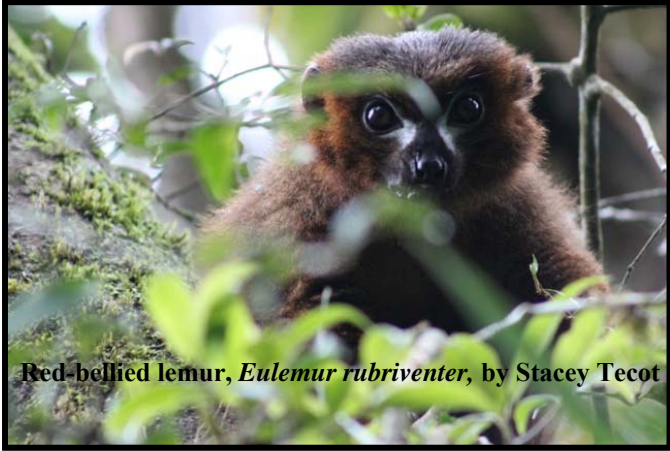
Red-bellied lemur, Eulemur rubriventer

7. Advocate for students and others whose careers are vulnerable. Temporarily ending field research will result in critical gaps in data collection and continuity that have negative consequences for long-term research projects and for the career trajectory of students, lab techs, postdocs, and contingent and untenured faculty. Therefore, we feel strongly that it is the responsibility of tenured faculty, emeritus professors, and faculty advising students to work proactively with their academic departments, faculty senate, and institutional administrators to mitigate these negative consequences by extending the timeline for students to complete degree requirements, helping to identify alternative financial support for these students, allowing students to substitute library research for field