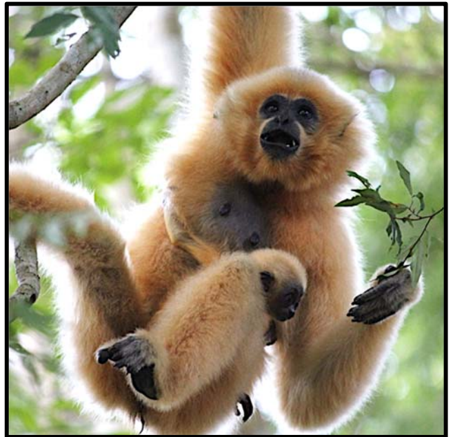
Yellow-cheeked crested gibbon, Nomascus gabriellae