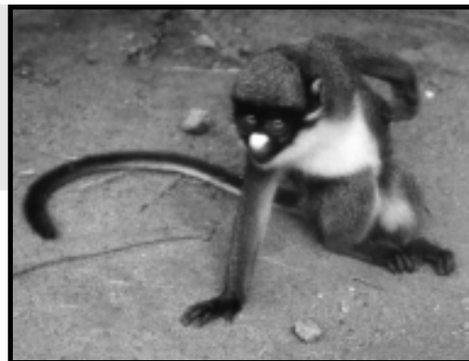
A lesser spot-nosed guenon ( Cercopithecus petaurista) for sale in eastern Cote d'Ivoire.