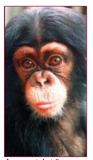
Language student. Panzee, a female chimpanzee (Pan troglodytes) shown here at age three years, and a bonobo (P. paniscus) were raised together in a study that examined their untutored mastery of wordlexigrams and their comprehension of human speech.

Rational behaviorism posits that the intelligent, novel behaviors animals exhibit to achieve specific goals are not learned solely through experience, nor are they shown by all members of a species. Instead, some spontaneously emerge as dynamic responses, more than the sum of their parts, elicited by adaptive challenges. To Rumbaugh and Washburn, these behaviors "resist a conditioning explanation but seem to reflect animals' natural and active inclination to seek predictive relations," which they call "emergents." The process by which behavioral patterns are altered to