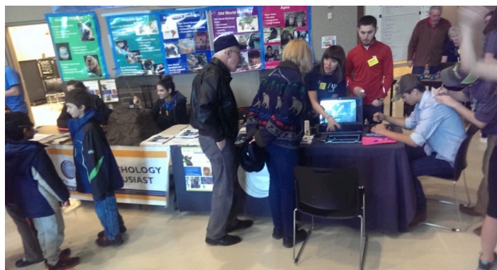
Members of the Central Oregon Psychology Enthusiasts (COPE) club presenting ASP's "Are You Smarter Than a Monkey" booth at Sister's High School Science Club Science Fair on February 21.