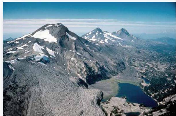
Pubs.usgs.gov Three sisters volcanoes near Bend OR.