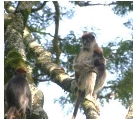
Female with infant.