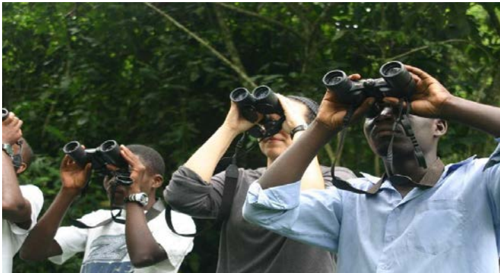
Some of the field assistants and me watching monkeys. We needed a large team to follow all the groups and collect samples.

The results of this study suggest that females in poor quality habitats can adjust mating behaviors to maximize the likelihood of conception while minimizing their energetic output. However, this energetic strategy may come at a cost of reducing the ability for females to use nonconceptive sex, outside the ovulatory period, as a reproductive strategy to confuse paternity, avoid infanticide, and enhance male support. Despite differences in habitat quality, females in logged and old-growth areas do not differ as expected in their reproductive hormone concentrations, ketone levels, or degree of reproductive seasonality. Phenotypic and behavioral plasticity in diet and energy expenditure may allow female red colobus monkeys to maintain reproductive function in lower quality habitats that are stable and protected. The ability to adjust to previously logged habitats that are now protected has important implications for conservation management strategies, such as prioritizing areas for protection, and provides insight into how extant primates, including humans, adjust to environmental change.