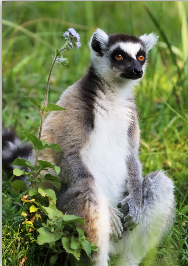
Ring-tailed lemur ( Lemur catta)