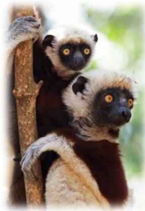
Coquerel's sifaka ( Propithecus coquerelli)