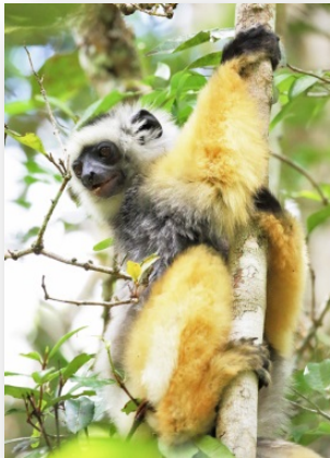
Diademed sifaka ( Propithecus diadema)