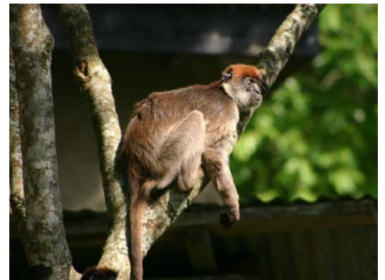
Red colobus monkey.

This project used the red colobus monkey ( Procolobus rufomitratus ) of Kibale National Park, Uganda, as a model to understand how ecological stressors impact female reproductive function and sexual behaviors. By combining behavioral observations, urinalysis, hormone analyses, habitat data, and feeding tree data, this research not only addresses if species are being impacted by forest degradation, but how species are being affected. The overall goal of this project was to examine a model in which habitat degradation impacts food availability, which then impacts female reproductive hormones and behaviors. To assess this connection, I examined the difference in 5 major factors between females living in four groups in old-growth and heavily logged areas: 1) feeding ecology, 2) activity budgets, 3) sexual behaviors, 4) ketone concentrations (a urinary indicator of starvation), and 5) reproductive hormone concentrations.